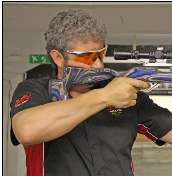
Gripping too high or with too much pressure will make it impossible for you to achieve a good trigger control!

Whether you refer to it as trigger pull, control, press, release or something entirely different it doesn't really matter as long as you physically operate it properly. Basically there are two types of "trigger control" that are used to fire a shot. The first is when the pressure on the trigger is continually increased in a slow and smooth manner to a point where a shot is eventually fired without that specific moment being determined by the shooter, and it is known as a "surprise" break (or release). The second