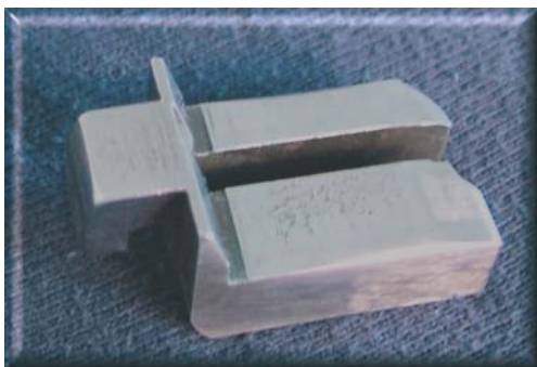
The locking block

The locking block also had quite a few rough surfaces and particular attention was given to the sides where it rises and falls inside the frame.