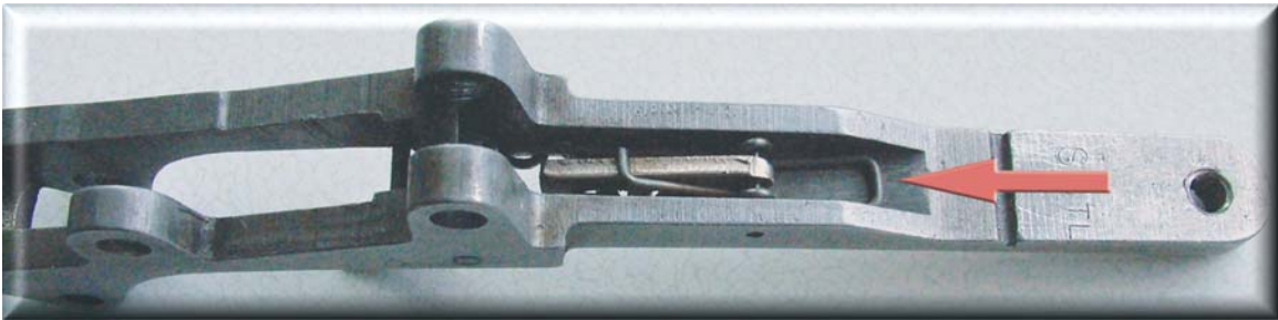
Trigger block safety spring

The last thing to do was relieve some of the tension on the trigger block safety spring by placing a flat ended screwdriver under the looped end and prying it up slightly so that the lever will close easier. The relevant parts were then oiled up and the rifle put back together and function tested. The action certainly felt a lot smoother cycling through some dummy rounds and the trigger pull weight was a lot lighter with the new spring installed. All that's left now is to test fire it at the range to check for reliable primer ignition.