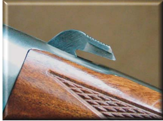
and modified hammer!

material removed but as it was, everything was ok. The common sense approach for anyone doing this for the first time would be to mark out and remove a small amount of metal, polish it, refit it back into the action then test the results. Then, simply repeat the process re-marking and making slight adjustments to the area to be profiled. Although it may take quite a few attempts to get it just right, remember removing metal is easy! Adding it on the other hand is a whole different problem! Combined with this re-profiling I changed the standard hammer spring to one that resembles a Ruger 10/22 piece that I had lying around in the shed. It just means I have to use Federal primers to ensure reliable ignition, but it's all I've ever used anyway, so no change there! As well as helping achieve a very slick action it also decreases the trigger pull weight dramatically as it reduces the holding pressure on the sear. It's well worth trying different springs you have lying around and testing them on the range as you can always cut them to length, or simply add a small washer at each end until you get perfect reliability. It's also much cheaper than some "performance kits" out there whilst achieving at least the same, and more often than not a better result!