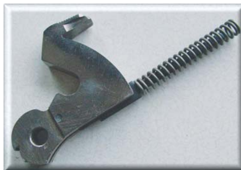
10/22 hammer spring = Fedral primers

Modifying the hammer and hammer spring will also substantially reduce the effort required to rack the bolt back and if done properly will provide a very smooth action that should help you shoot better on the range. Starting with the hammer, the first thing that I did was remove the burrs from one side of the hammer where it had been binding against the frame slightly. I then de-burred the edges of the strut that the spring fits over, along with the hammer screw and the hole that it locates in and finished of with some light stoning around the arc of the hammer as it had quite a rough finish on it. I then polished up these areas and put the rifle back together again ready for the next step which was to re-profile the hammer. The most important thing to do before you start removing any